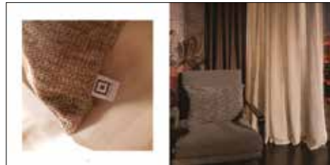
Pag. 14-15 Cuscino con coda di topo/Cushions with piping: Monsieur-Dune

Federa a sacchetto/Pillowcases: Canotier-Gold/Borders: Teatime-Gold Copripiumino/Duvet Cover: Canotier-Gold Cuscini con coda di topo/Cushions with piping: Monsieur-Dune Cuscini con coda di topo/Cushions with piping: Monsieur-Tiger