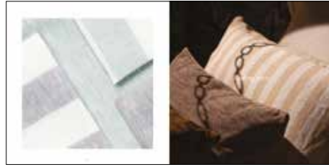
Pag. 8-9 Tessuti/Fabrics: Canotier/Teatime

Federa a sacchetto/Pillowcase: Canotier-Gold/Borders: Teatime-Gold Cuscino con coda di topo/Cushion with piping: Monsieur-Dune Cuscino con coda di topo/Cushion with piping: Monsieur-Tiger