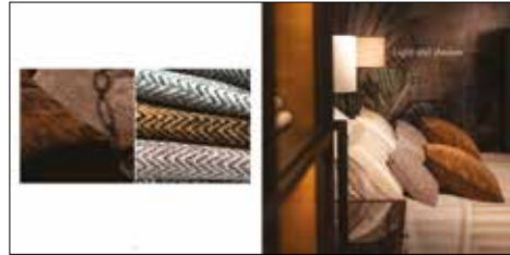
Pag. 12-13 Tessuti/Fabrics: Monsieur

TURPAN 180 Banquette: Pat-Sand Set letto/Bedding Set: Federe 4 Volant /Pillows with 4 Borders: Teatime-Ivory/Borders: Canotier-Gold Federa a sacchetto /Pillowcases: Canotier-Gold/Borders: Teatime-Gold Copripiumino/Duvet Cover: Canotier-Gold Copriletto/Bedspread: Otium-Gesso/Border: Pat-Sand Cuscini con coda di topo/Cushions with piping: Monsieur-Dune Tende/Curtains: Ponentino-Soap