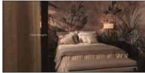
Pag. 10-11 Tessuto per Parete/Fabric Wallcovering: The Grand Design, Sarasvati-Bronze

Federa a sacchetto/Pillowcase: Canotier-Gold/Borders: Teatime-Gold Cuscino con coda di topo/Cushion with piping: Monsieur-Dune Cuscino con coda di topo/Cushion with piping: Monsieur-Tiger