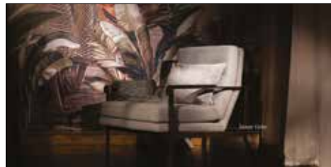
Pag. 16-17 Tessuto per Parete/Fabric Wallcovering: The Grand Design, Sarasvati-Bronze

DANCALIA Poltrona in Metallo/Metal Armchair: Pat-Green Frost Cuscini con coda di topo/Cushions with piping: Monsieur-Mint Tende/Curtains (on the left): Farniente-Bisonte Tende/Curtains (on the right): Ponentino-Soap