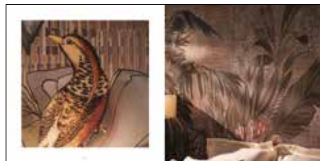
Pag. 20-21 Tessuto per Parete/Fabric Wallcovering: The Grand Design, Sarasvati-Bronze

DANCALIA Poltrona in Metallo/Metal Armchair: Pat-Green Frost Cuscini con coda di topo/Cushions with piping: Monsieur-Mint Tessuto/Fabric: Monsieur-Emerald